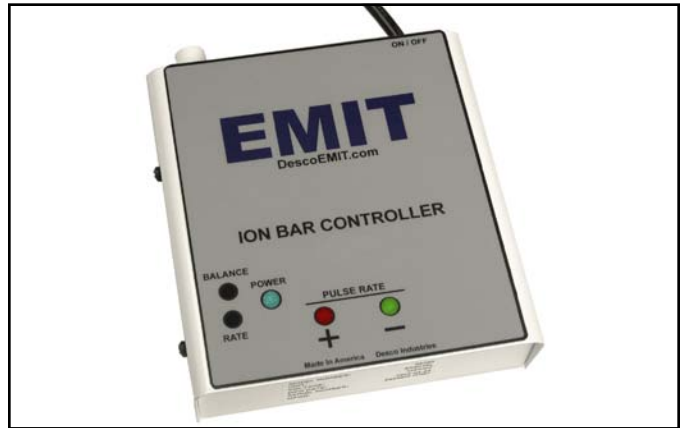
Figure 3. EMIT 50940 Controller with Recessed Potentiometer Adjustment