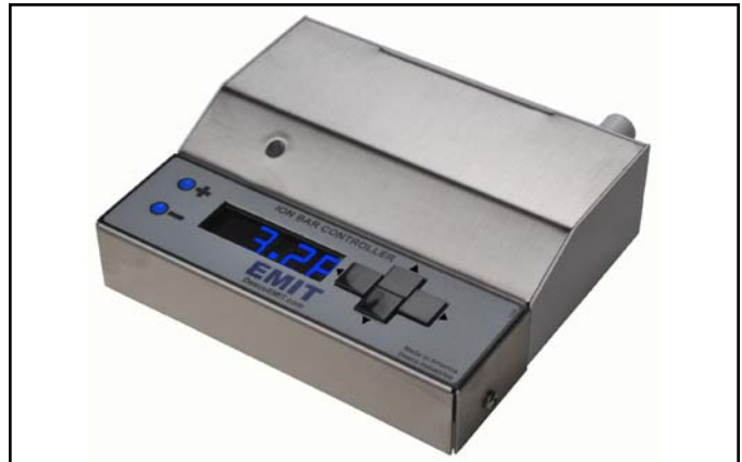
Figure 5. EMIT 50855 Controller with Digital Adjustment