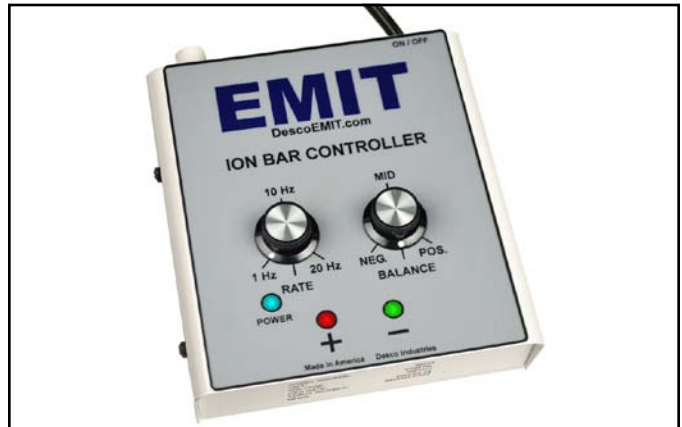
Figure 4. EMIT 50945 Controller with External Potentiometer Adjustment