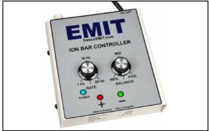
Figure 4. EMIT 50945 Controller with External Potentiometer Adjustment