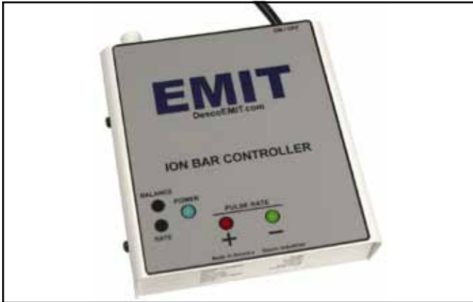
Figure 3. EMIT 50940 Controller with Recessed Potentiometer Adjustment