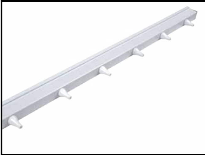
Figure 1. EMIT Non-Air Assisted Ion Bar