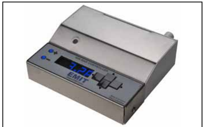
Figure 5. EMIT 50855 Controller with Digital Adjustment