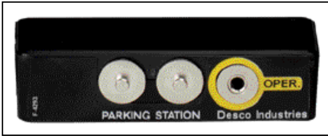
Figure 1. EMIT Universal Remote