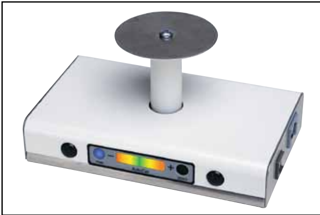
Figure 1. EMIT Auto Calibration Unit, Item 50610