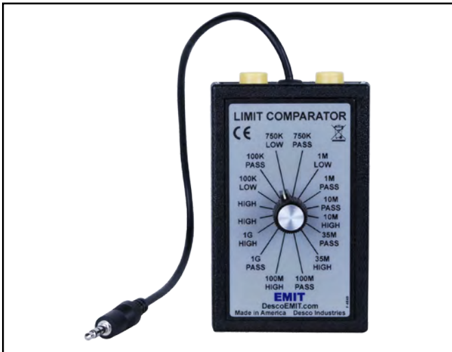
Figure 4. EMIT 50422 Limit Comparator

The EMIT Limit Comparator allows the customer to perform NIST traceable calibration on a number of EMIT Testers including the 50404 , 50412 . The Limit Comparator can be used on the shop floor within a few minutes virtually eliminating downtime, verifying that the Dual Independent Footwear Tester is operating within tolerances.