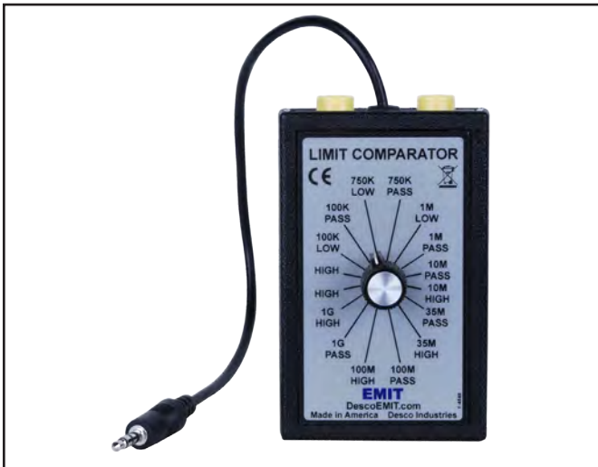
Figure 4. EMIT 50422 Limit Comparator

The EMIT Limit Comparator allows the customer to perform NIST traceable calibration on a number of EMIT Testers including the 50404, 50412. The Limit Comparator can be used on the shop floor within a few minutes virtually eliminating downtime, verifying that the Dual Independent Footwear Tester is operating within tolerances.