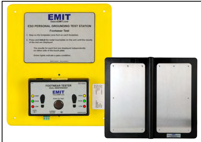
Figure 1. EMIT Dual Independent Footwear Tester and Dual Foot Plate