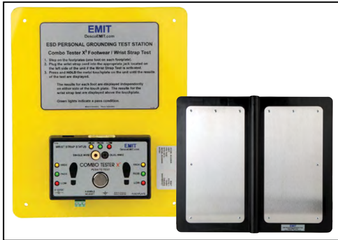
Figure 1. EMIT Dual Independent Footwear and Wrist Strap Tester and Dual Foot Plate