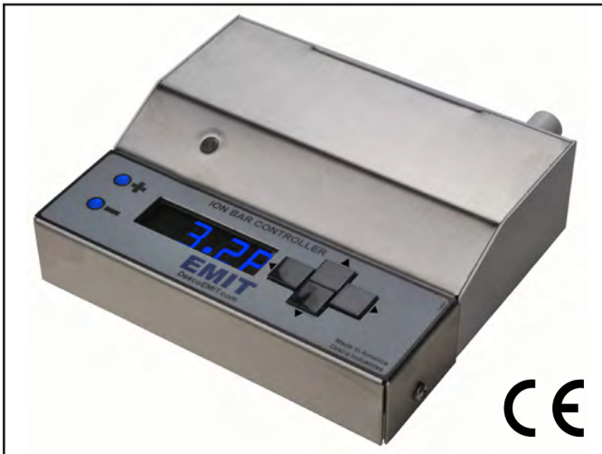
Figure 1. EMIT Pulsed Ion Bar Controller