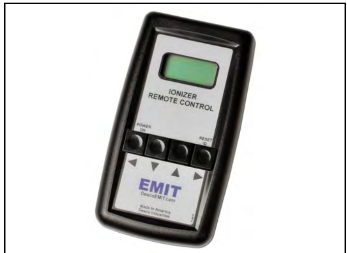
Figure 3. EMIT 50669 Ionizer Remote Control

NOTE: The control buttons can only be disabled (“OFF b”) by the 50669 Ionizer Remote Control.